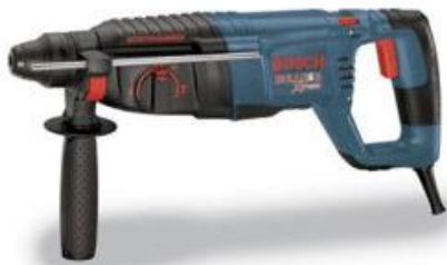
SDS Rotary Hammer Drill